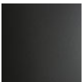
OP69 matt graphite