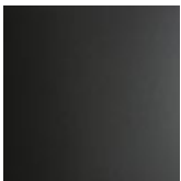
OP69 matt graphite