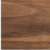
NC walnut canaletto