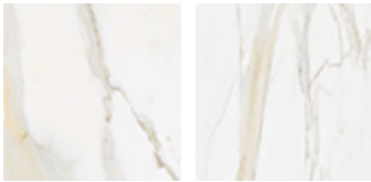
KM05 matt Golden Calacatta