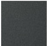
GF69 embossed graphite