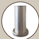
B1 black or alu