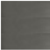
OP0 transparent varnished