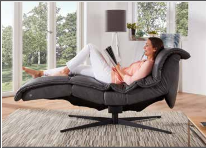
electric adjustment to a relaxed sitting position