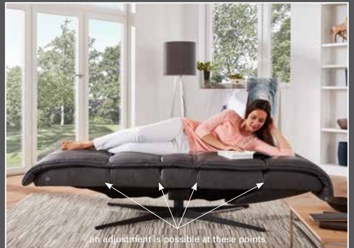
an adjustment is possible at these points