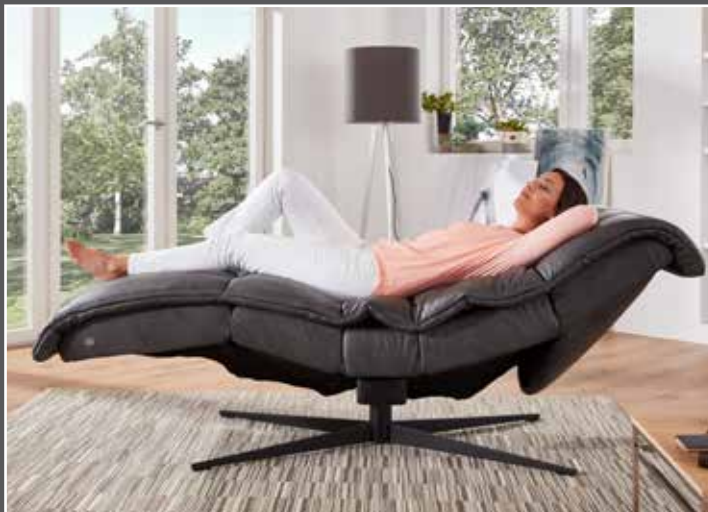
adjustment of leg rest, seat inclination and headrest to a horizontal sleeping position