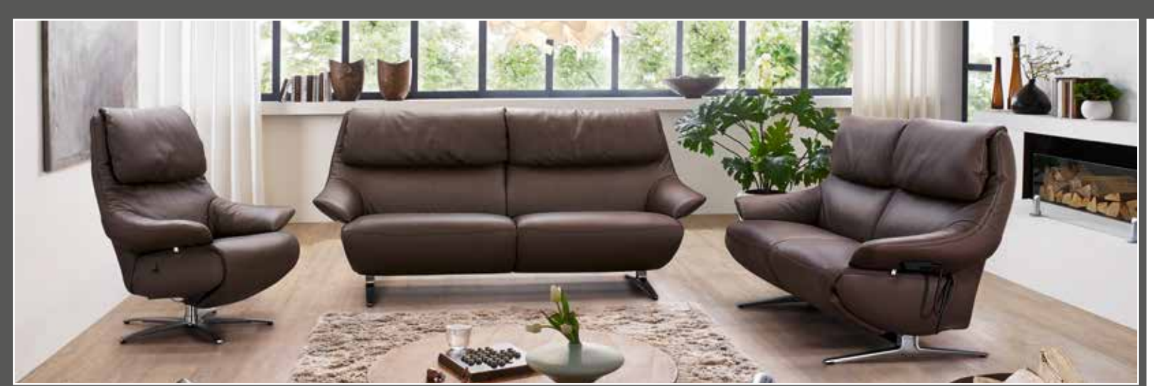
Variant 12X / 81Q with Cosyform armchair 7602 in 24 Longlife Rustika earth