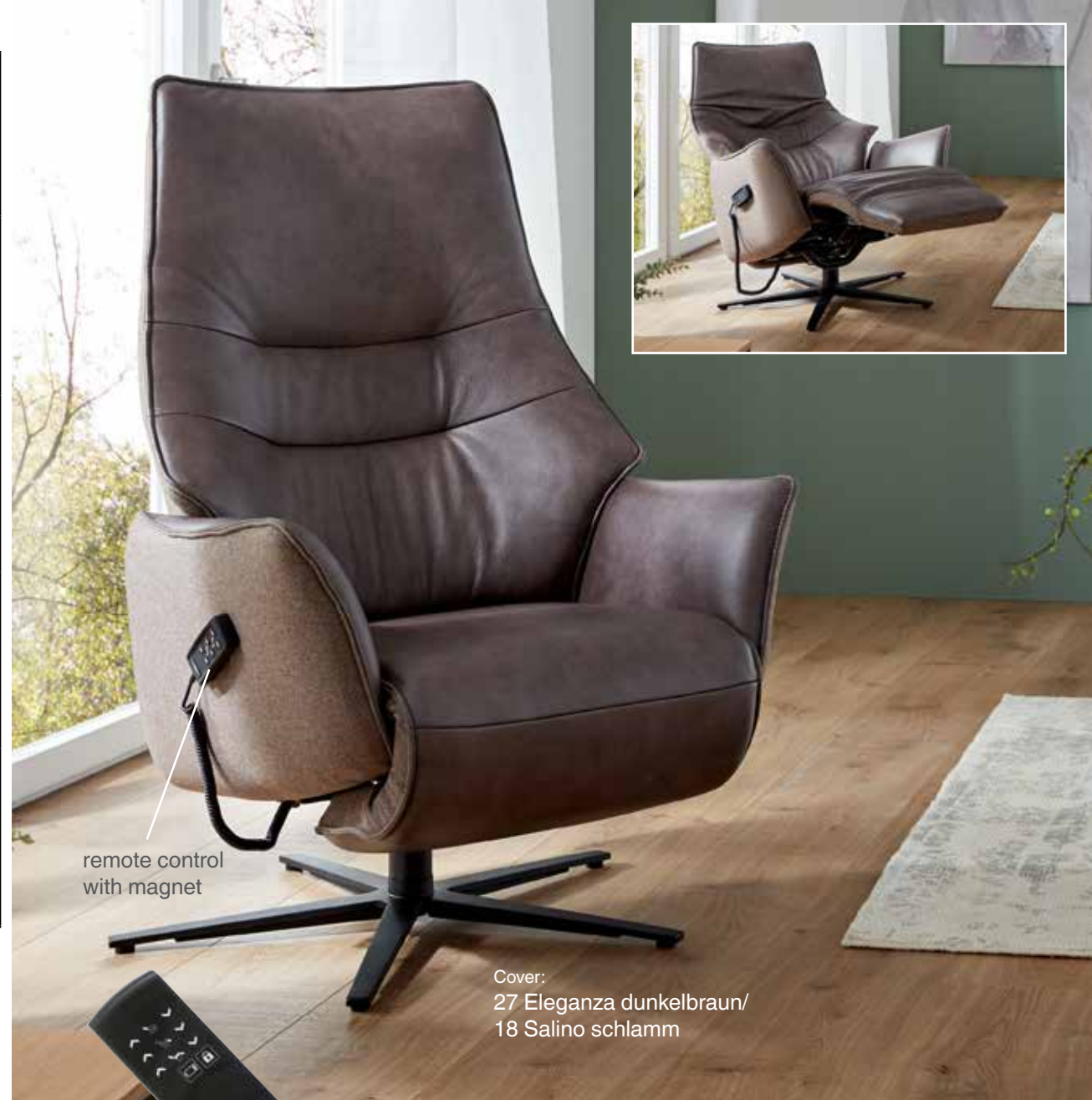
remote control with magnet